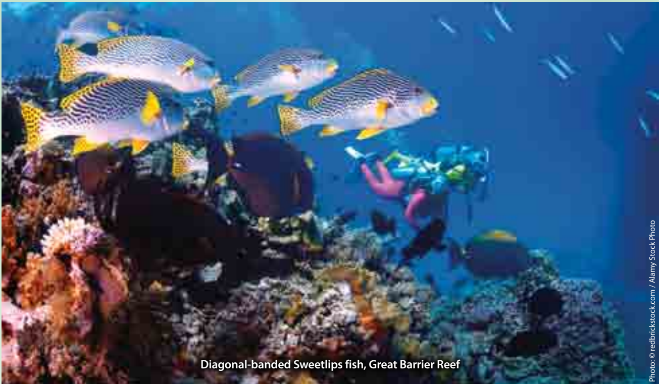
Diagonal-banded Sweetlips fish, Great Barrier Reef