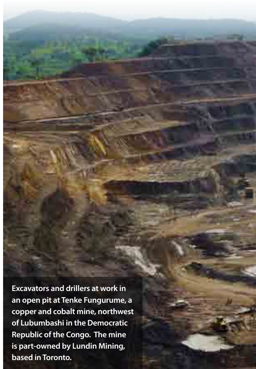
Excavators and drillers at work in an open pit at Tenke Fungurume, a copper and cobalt mine, northwest of Lubumbashi in the Democratic Republic of the Congo. The mine is part-owned by Lundin Mining, based in Toronto.

The warming (of the climate) caused by huge consumption on the part of some rich countries has repercussions on the poorest areas of the world, especially Africa, where a rise in temperature, together with drought, has proved devastating for farming. There is also the damage caused by the export of solid waste and toxic liquids to developing countries, and by the pollution produced by companies which operate in less developed countries in ways they could never do at home, in the countries in which they raise their capital.