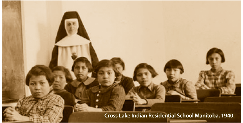
Cross Lake Indian Residential School Manitoba, 1940.

New processes taking shape cannot always fit into frameworks imported from outside; they need to be based in the local culture itself. As life and the world are dynamic realities, so our care for the world must also be flexible and dynamic. Merely technical solutions run the risk of addressing symptoms and not the more serious underlying problems.