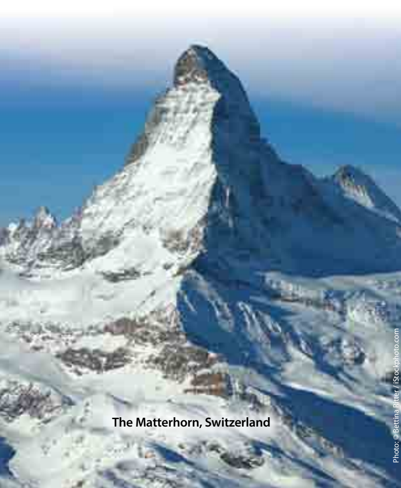
The Matterhorn, Switzerland

At the same time, we have “a sort of ‘superdevelopment’ of a wasteful and consumerist kind, which forms an unacceptable contrast with the ongoing situations of dehumanizing deprivation” (Benedict XVI), while we are all too slow in developing economic institutions and social initiatives which can give the poor regular access to basic resources. (109)